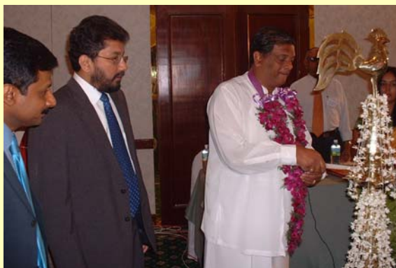
Jeyaraj Fernadopulle, Trade Minister of Sri Lanka, Saman Kelegama of IPS, and Mohan Kumar, Deputy High Commissioner of India at the Inaugural.

The event involved academicians, business chambers, government and inter-governmental organisations and civil society representatives. The project focused on the five key issues of agriculture, non-agricultural market access, development dimensions, services, and trade facilitation.