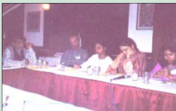
GRANITE Training Seminar at Kolkata on January 27-28, 2006

The members of National Coordination Unit (NCU) of CUTS-CITEE and nodal persons and programme coordinators from all project-partnering organisations from eight states attended the seminar.