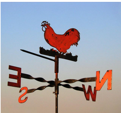
Future strategy of the Centre will focus on 10-point agenda