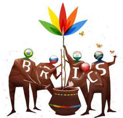
South-South cooperation such as between and among the BRICS group and other emerging economies

international trade regime under the aegis of the World Trade Organisation and bilateral/regional free trade agreements.