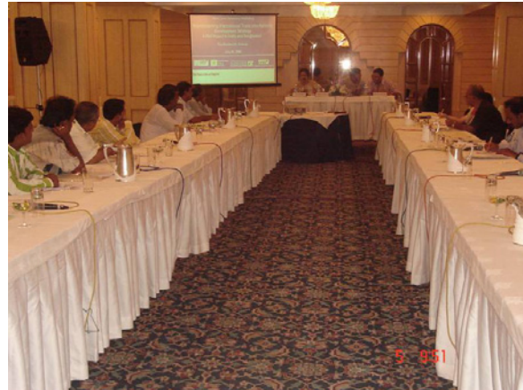
A view of the participants

Cheriyam He went on to inform that similar to the evaluation exercise of the MDMS in Rajasthan, CUTS used a combination of CRC, PETS and CSC for evaluating NREGS in the Sirohi District of Rajasthan. While CRC and CSC were used for qualitative feedback and to assess beneficiary perceptions and satisfaction levels, PETS was used for the quantitative assessment of funds flow, fund utilisation etc. The survey revealed some striking results: a majority of the respondents accepted that NREGS had helped in not only increasing the bargaining power of the labourers also it has been instrumental in women empowerment and arresting migration, he explained.